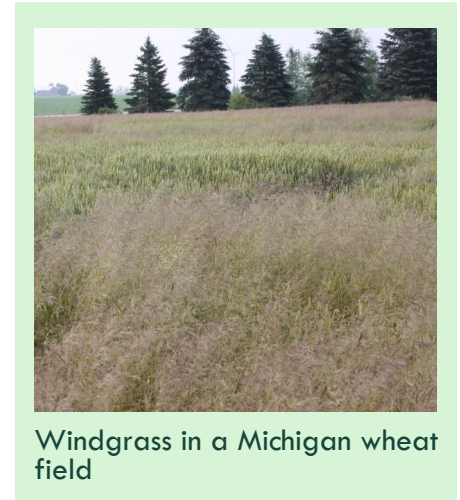
Windgrass in a Michigan wheat field