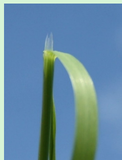
Jagged membranous ligule