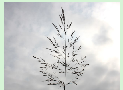
Open-branched, reddish panicle