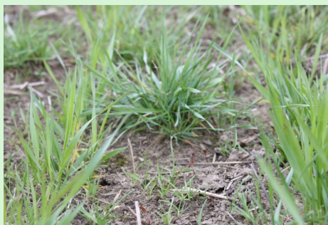
Tillering of windgrass in wheat