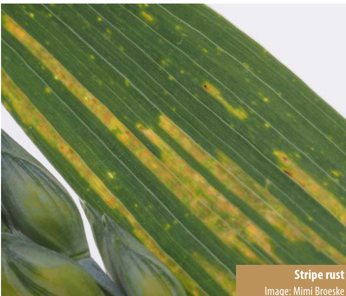
Stripe rust

The information in this publication is only a guide, and the authors assume no liability for practices implemented based on this information. Reference to products in this publication is not intended to be an endorsement to the exclusion of others that may be similar. Individuals using such products assume responsibility for their use in accordance with current directions of the manufacturer. The U.S. Department of Agriculture (USDA) prohibits discrimination in all its programs and activities on the basis of race, color, national origin, age, disability, and where applicable, sex, marital status, familial status, parental status, religion, sexual orientation, genetic information, political beliefs, reprisal, or because all or a part of an individual's income is derived from any public assistance program. (Not all prohibited bases apply to all programs.) Persons with disabilities who require alternative means for communication of program information (Braille, large print, audiotape, etc.) should contact USDA's TARGET Center at (202) 720-2600 (voice and TDD). To file a complaint of discrimination write to USDA, Director, Office of Civil Rights, 1400 Independence Avenue, S.W., Washington, D.C. 20250-9410 or call (800) 795-3272 (voice) or (202) 720-6382 (TDD). USDA is an equal opportunity provider and employer. ©2023 by the Crop Protection Network. All rights reserved.